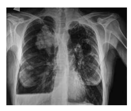
FIGURE 1. Chest X ray showing emphysematous lungs, a right upper lobe mass, airfluid level of the right basis, fibrotic lesions of left upper lobe causing hilar elevation and gynecomastia.

Giant bullae are bullae that occupy at least 30% of a hemithorax. They may develop as a consequence of cigarette smoking, alpha 1-antitrypsin defeciency, Marfan syndrome and may be complicated by pneumothorax, bronchogenic carcinoma, fluid accumulation and infection within the bulla.